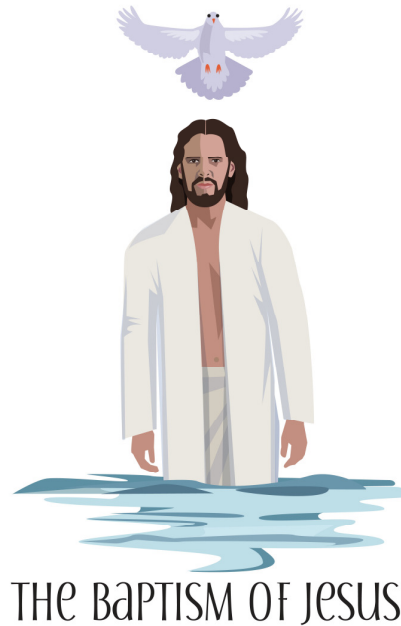
THE BAPTISM OF JESUS