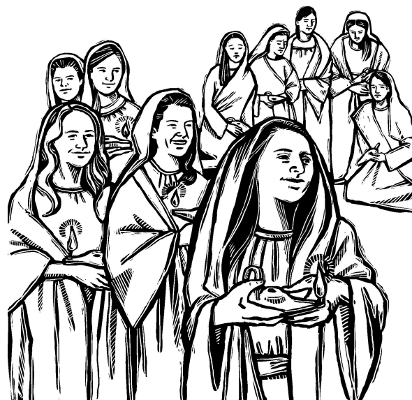
The Parable of the Ten Bridesmaids