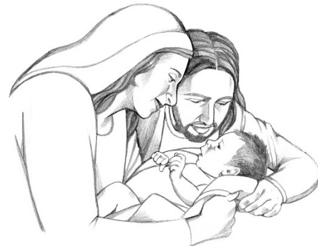
The Miracle of Christmas

Mon: Parish Office Closed Mon: 8:30am NO MASS Mon: 10:00am MASS - Solemnity of Mary, Mother of God - English Mon: 11:45am MASS – Solemnity of Mary, Mother of God - Spanish/Español Tue: 5:30pm MASS Tue: 6:30pm Choir Practice Wed: 12:00pm MASS Wed: 12:30pm Legion of Mary Wed: NO YOUTH CLASSES Wed: 7:00pm RCIA Wed: 7:00-8:00pm Mardi Gras Mtg. Thu: 8:30am MASS Thu: 9:00am-9:00pm Adoration Thu: 6:30pm Spanish Choir Fri: 12:00pm MASS - First Friday Sat: 9:00am MASS - First Saturday Sat: 3:30-4:30pm Bilingual Reconciliation Sat: 5:00pm MASS Sun: 7:45am MASS Sun: 8:45-9:45am Catholic Kids Sun: 10:00am MASS Sun: 11:45am MASS - Spanish/Español Sun: 5:00pm MASS – Life Teen